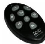
Optional infrared remote control